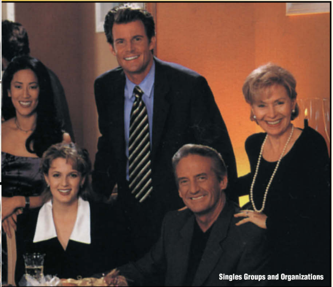
Singles Groups and Organizations